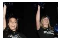
Selection Sunday at UNCA