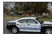
Hendersonville police shooting scene